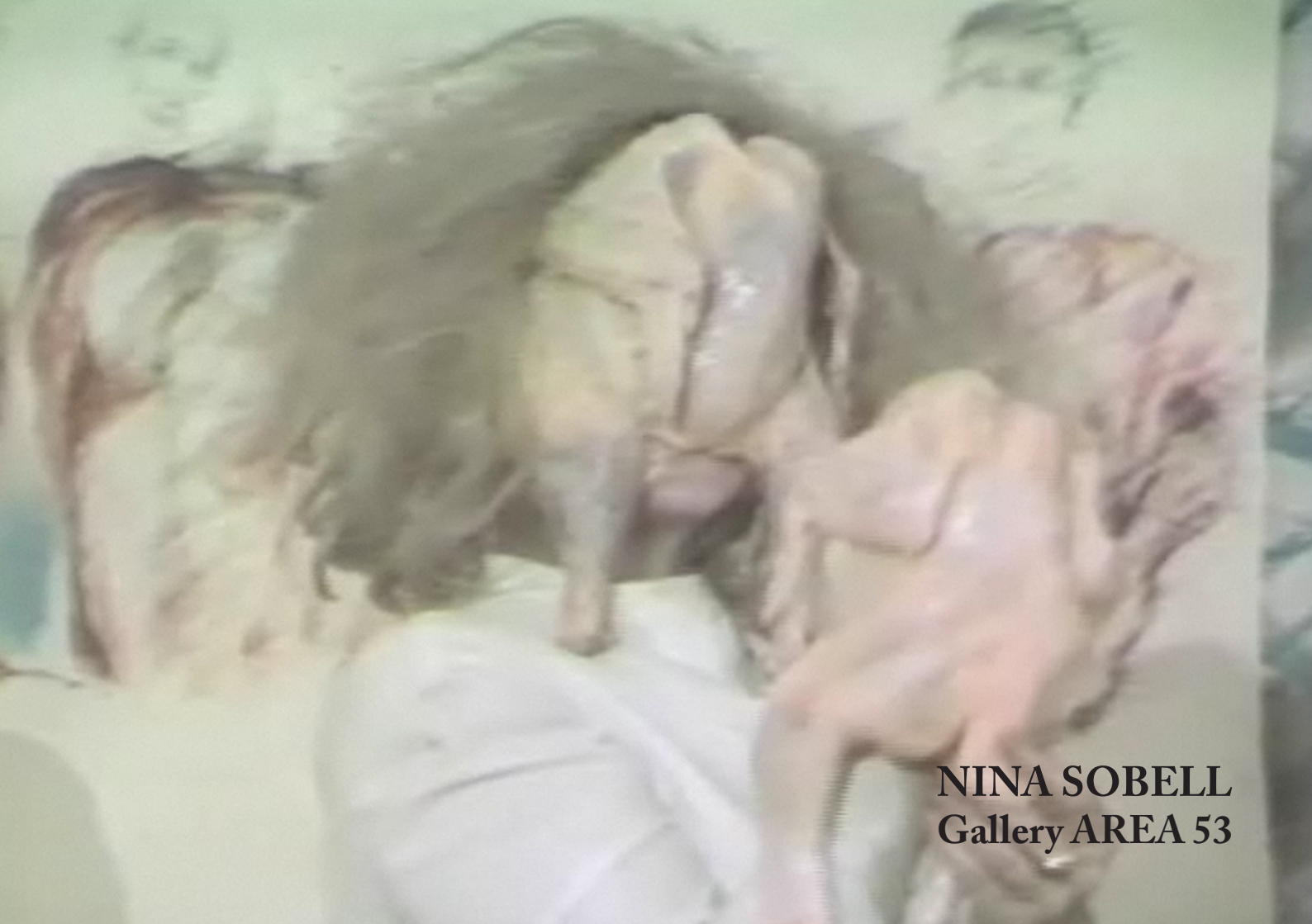
NINA SOBELL Gallery AREA 53