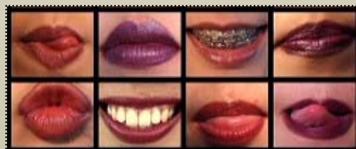
Figure it Out – performance in video – curated by Wilfried Agricola de Cologne

Performance is representing a most relevant aspect in art video, whereby it is very often the performance of the artist himself standing in the focus, another artistic focus is directed on intervening performative processes with the camera and other personal involvement. The compilation give an idea how artists find their individual language via the movement of processes.